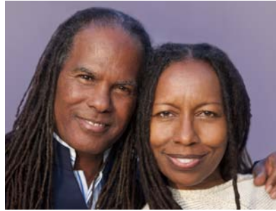
Rickie Byars Beckwith and Rev. Dr. Michael Bernard Beckwith

“We’ve grown a lot!” says Rickie BB. “We have the most