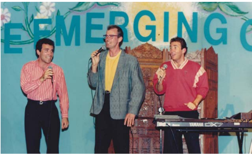
Vocal group Alliance

We can all know everything without ever knowing why, It's in every one of us by and by.