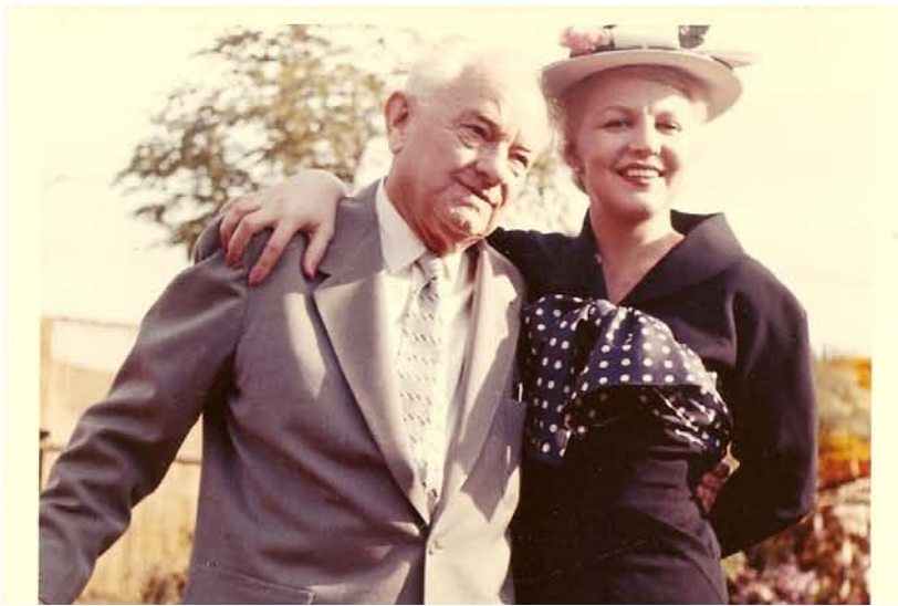
Ernest Holmes and Peggy Lee